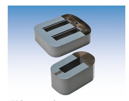
High-frequency transformer core