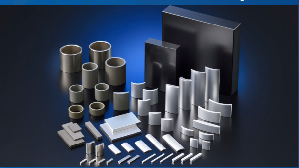
NEOMAX® neodymium magnets