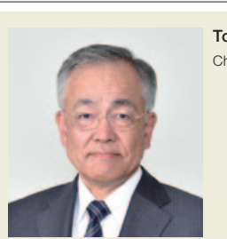
Attendance at meetings during fiscal 2015 Board of Directors: 14 out of 14 meetings

Note: Information regarding attendance at meetings held between June 2015 and May 2016 is provided