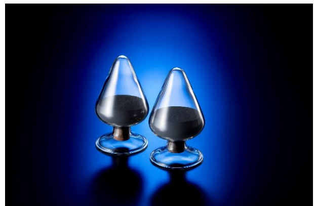
Cathode materials for lithium-ion batteries

There are more options for the starting materials used for manufacturing cathode materials* 4 , and it is possible to reduce the GHG emissions from raw materials by using the solid state reaction method that enables the use of materials that are not water-soluble. Hitachi Metals will provide the developed technologies as solutions to customers engaging in the mass production of cathode materials/LIB development.