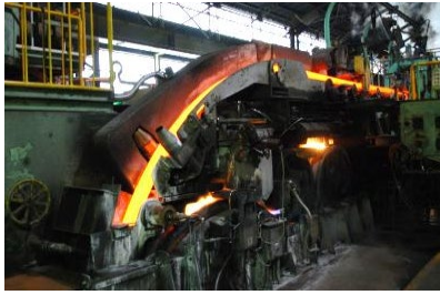
Continuous casting and rolling equipment