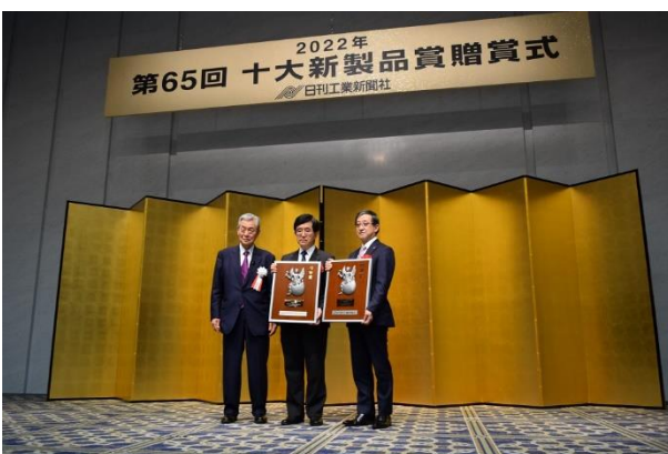
Recipients of the Masuda Award at the award ceremony

Proterial will continue to respond to increasingly diverse needs as it strives to develop the high-performance materials that support social infrastructure.